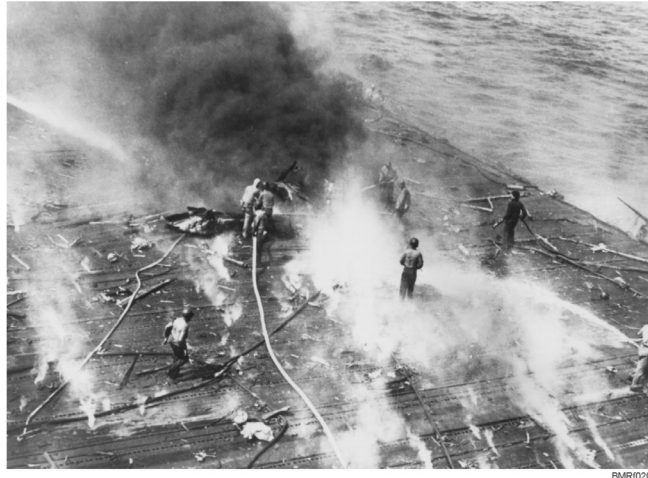
Figure 2-1.—The results of discipline are shown in prompt and correct action in an emergency, and especially in battle efficiency.

concerted action for the attainment of a common goal. Each individual understands how to fit into the organization as a whole. The members understand one another through the sharing of common knowledge. They are bound together by a unity of will and interest expressed by their willingness to follow and obey their leader. A group so organized is effective, not only for the specific purpose intended, but also for an emergency. Thus, a gun crew may be readily converted into a repair party for carrying out any essential job within its capabilities; a company of midshipmen may be turned into a fire-fighting organization. A well-disciplined naval unit responds automatically to an emergency and is not subject to panic.